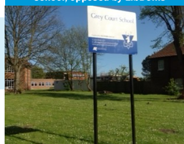
The new Sixth Form at Grey Court School currently under construction, opposed by LibDems