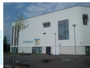
A new Sixth Form at Teddington school, opposed by local LibDems

In partnership with Richmond College and leading edge businesses create a new Enterprise and Education Campus in Twickenham