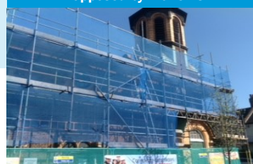
A new Free Primary for Mortlake and East Sheen, opposed by LibDems