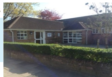
The newly improved Library and Community Centre in Ham

IN TWICKENHAM — Complete Town Centre renewal. Two new secondary schools by 2017. New Community Hall & performance space. New River Park