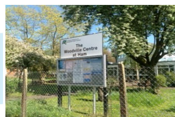
The new Woodville Centre in Ham for dementia care, obstructed by LibDems

Maintain a drive against benefit cheats to release resources for those really in need