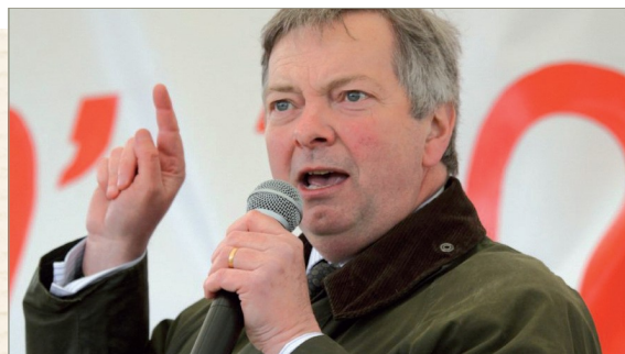
Lord True: Campaigning against Heathrow Expansion

There is much more in our Manifesto—it is a record of action and the promise of more. For there is much more to do. We can't afford a lurch back to the failed old high-tax, high-borrowing policies our opponents cling to. On May 22 you decide . To trust our successful team with a second term. Or to call back the past. Please give us your trust. We have kept our promises. We will not let you down.