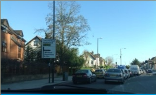
The dangerous A316—with TfL, this will be one of our next council's priorities for safer routes for cycling