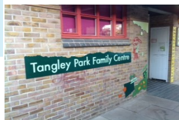
The new Tangle Family Centre in Hampton, not supported by LibDems