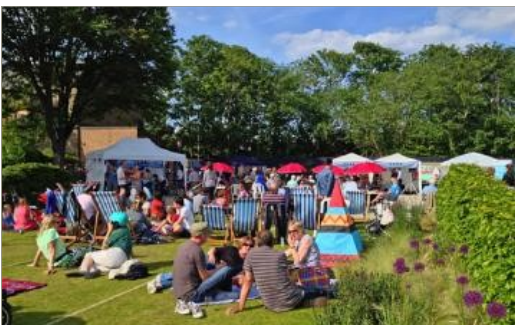
The new Diamond Jubilee Gardens, Twickenham, created after the land was saved from a LibDem sell-off