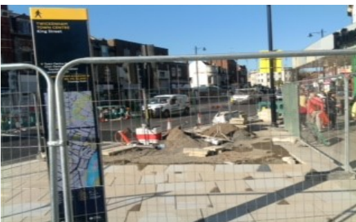
New pavements in the uplift of central Twickenham, just one piece of our multi-million pound investment