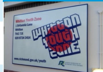
New Whitton & Heathfield Youth Zone LibDems planned to hire an empty shop