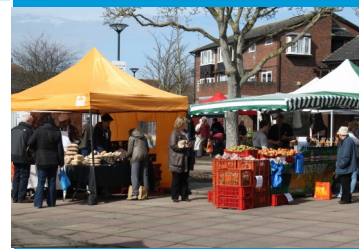
The New Hampton Square, not supported by LibDems