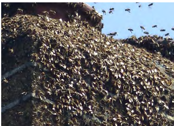
Bee Swarm on Good Friday afternoon

The Oaks have leaves before the Ash so if English Folklore is correct then this Summer will be Dry! Climate change and water poverty is in the news but only when it affects us personally does it seem to hit home. What will we do to minimise water usage today?