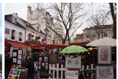
Place Du Tertre with Sacre Coeur