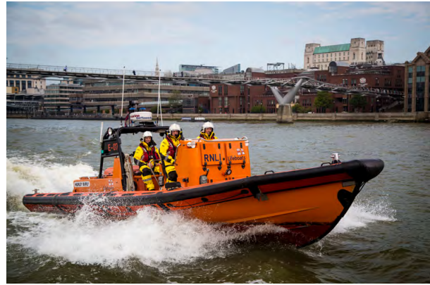
The Tower Lifeboat Hurley Burley

London Lifeboat Day takes place just once a year and this year's collection is of particular significance as it marks the 30th anniversary of the Marchioness disaster which saw 51 lives lost on the river in the early hours of 20 August 1989. It was as a result of the enquiry into the tragedy that the RNLI launched a rescue service on the Thames on 2 January 2002.