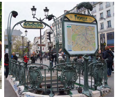
Metro Station Pigalle

A morning's stroll from The Louvre, through the Tuileries gardens, around Place De La Concorde and the length of the Champs Elysees will take an hour or two before relaxing with a coffee at one of the pavement cafes. The book stalls along the left bank of the Seine can offer interesting bargains with old magazines, in particular, proving popular. Continue westwards along the riverside as far as Les Invalides. Under the Dome of this imposing building is the tomb of Napoleon and a museum that tells the story of France's military history.