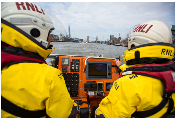
The money raised will be used to save lives along the river

As well as our full-time helms, who work shifts and sleep on station, our lifeboats rely on the bravery and commitment of our volunteers who come from an astonishing diversity of backgrounds. They leave their day jobs and their families to volunteer for a 12-hour shift, prepared to attend any incident to which they're tasked. Our London crews are ready to respond to emergencies in a matter of seconds.