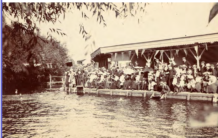
(Above) Boys and Girls Gala at Mereway Bathing Place