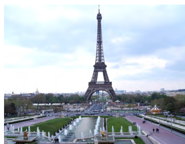
The Eiffel Tower