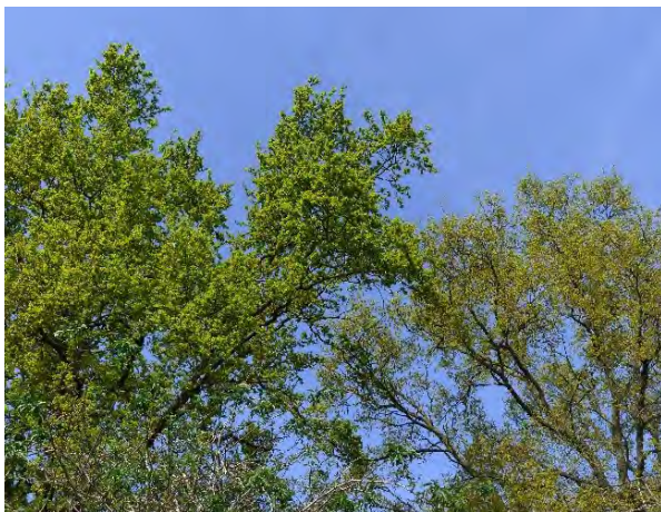
Two different Oaks in Leaf

“O Dandelion, yellow as gold, What do you do all day? “I just wait here in the tall green grass Till the children come to play.” “O dandelion, yellow as gold, What do you do all night?” “I wait and wait till the cool dews fall And my hair grows long and white.” “And what do you do when your hair is white And the children come to play?” “They take me up in their dimpled hands And blow my hair away.” Anon.