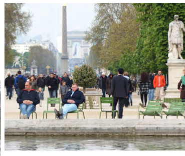
Tuilleries Gardens and Arc De Triomphe