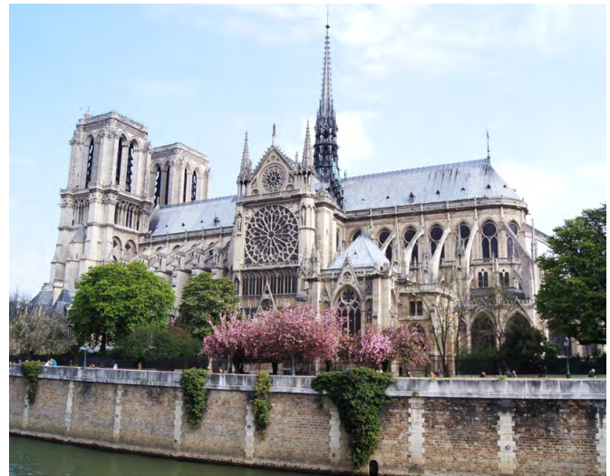
Notre Dame in all her splendour

The Cathedral of Notre Dame is in ruins and France is mourning its tragic loss. But just as York Minster was rebuilt after a great fire and the Cathedral of Reims, destroyed in World War 1, was carefully restored, so Notre Dame will rise again in splendour: perhaps not in the next five years optimistically predicted by President Macron. Sadly the 850 year old medieval monument, Europe's most popular with 14 million visitors each year, will be closed for years to come but that's no reason to overlook Paris as the perfect short-break city destination. It's so easy to reach from London by train, has a vast number of historic and modern sites to see and can be conveniently explored on foot. Best of all Paris is the place to sit in a quiet square and people watch.