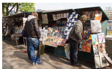
Book stalls on the Left Bank