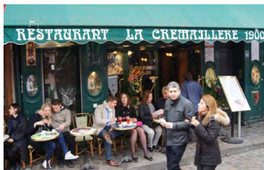
Eat well in Paris

A Seine River cruise gives a slower and lower perspective of the city and a candle-lit dinner on one of the Bateaux Mouches shows off some of the flood-lit buildings at their best. A Paris Region Pass has three options for unlimited transport, entry fees and much more. ( www.visitparisregion.com ).