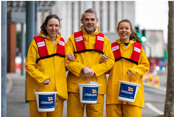
Collectors will be on the streets of London to support the RNLI's four lifeboat stations on the River Thames

Following the enquiry's recommendations RNLI stations were set up at Teddington, Chiswick, Waterloo Bridge (Tower Lifeboat Station) and Gravesend. Since then RNLI lifeboats have launched 13,793 times, saved 567 lives and aided 9,460 people. The four stations launched 1,022 times last year alone, making them some of the busiest in the country.