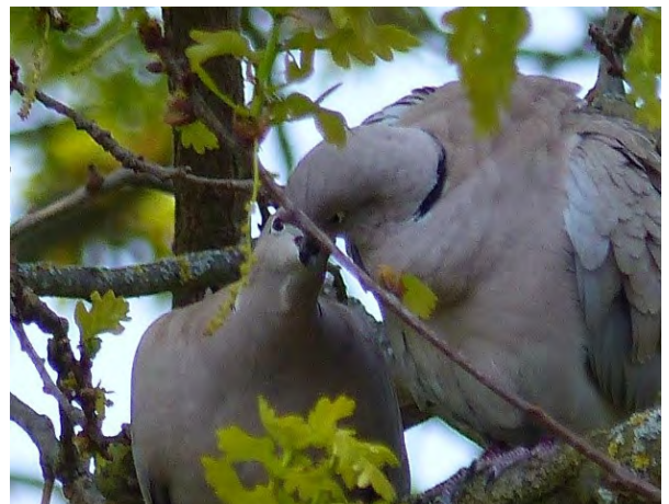
The Kiss – Romeo and Juliet Doves

The Oaks have leaves before the Ash so if English Folklore is correct then this Summer will be Dry! Climate change and water poverty is in the news but only when it affects us personally does it seem to hit home. What will we do to minimise water usage today?