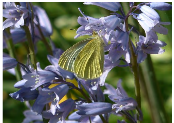
White Butterfly on Bluebell

We re-read Diet for a Small Planet recently (Frances Moore Lappe c.1971 ) and if you have been inspired or need more inspiration to change your diet to help tackle climate change, world inequality or just want to enjoy fabulous, healthy food with easy to follow tips on how to make personal changes; then this book is still relevant and historically interesting.