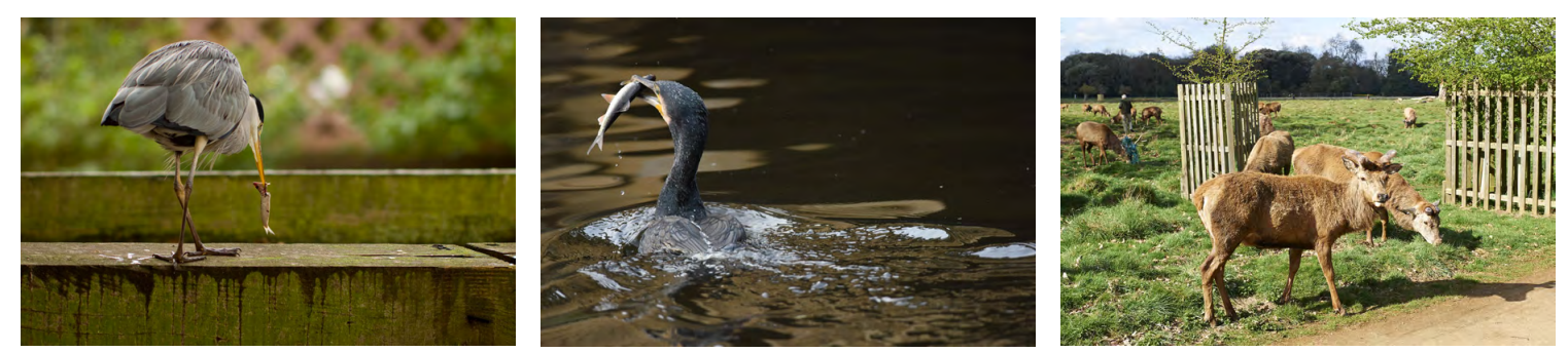
Grey heron with a fish

There is lots of natural food in the parks for wildlife, including insects, wildflower seeds, aquatic plants and grasses. These natural food sources offer wildlife a nutritious, balanced diet all year round that doesn't need to be supplemented by public feeding.