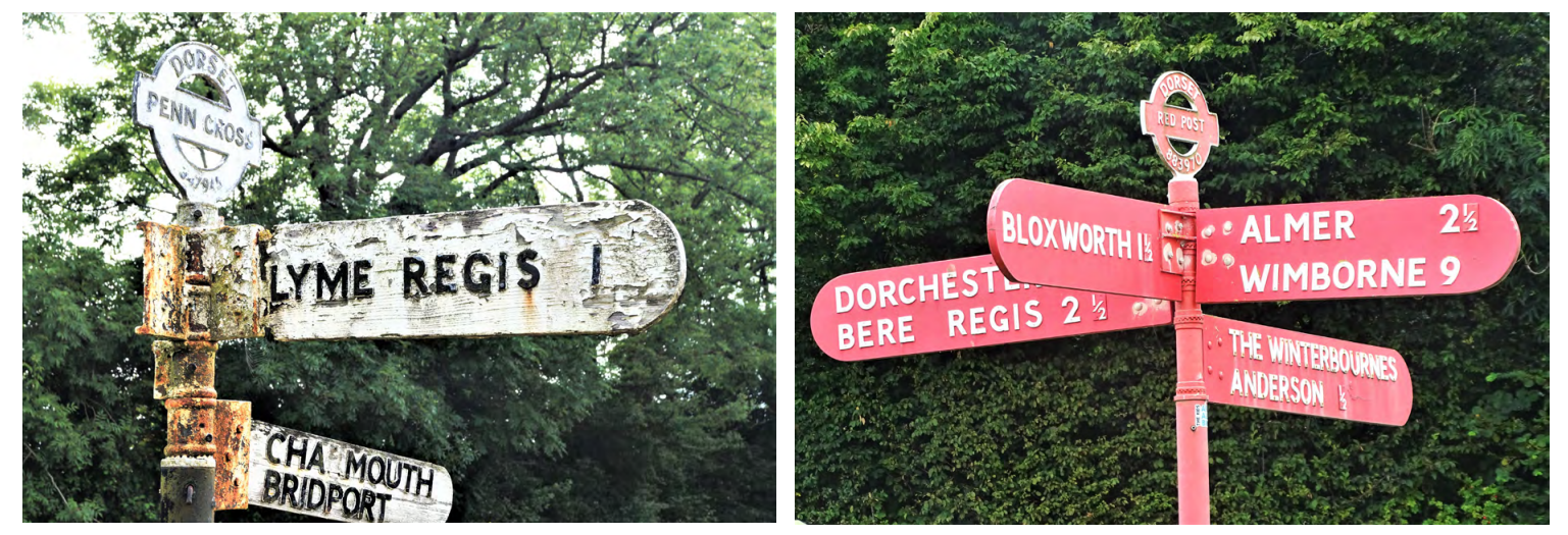
Finger Post Near Lyme Regis

On frequent journeys between Twickenham and West Dorset I have passed a red signpost on the A31 east of Bere Regis and wondered why it differed from the standard black and white country signs. It is painted red and one of four in Dorset. It's called a fingerpost and of more benefit to horse riders, cyclists and walkers than motorists. Fingerposts exist throughout Dorset with over 1200 listed in the 1950s. Today just over 700 survive with one near Lyme Regis in a sad state of repair when I photographed it. Happily it has been restored to its original condition and is much admired. There's a Dorset fingerpost preservation society to look after them. The posts were erected at crossroads to help local travellers but the red one on the A31 had a special significance.