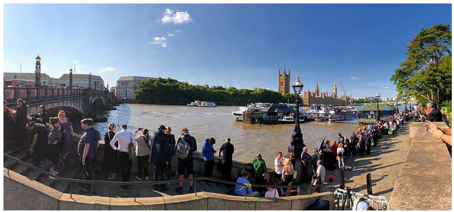
The Queue along the Albert Embankment and crossing Lambeth Bridge on the afternoon of 14 September 2022

Being in the business of observing and understanding people, I've been fascinated by the Queue. It's become more than just a physical queue with an end goal. It has provided real insight into human behaviour and who we are as a society