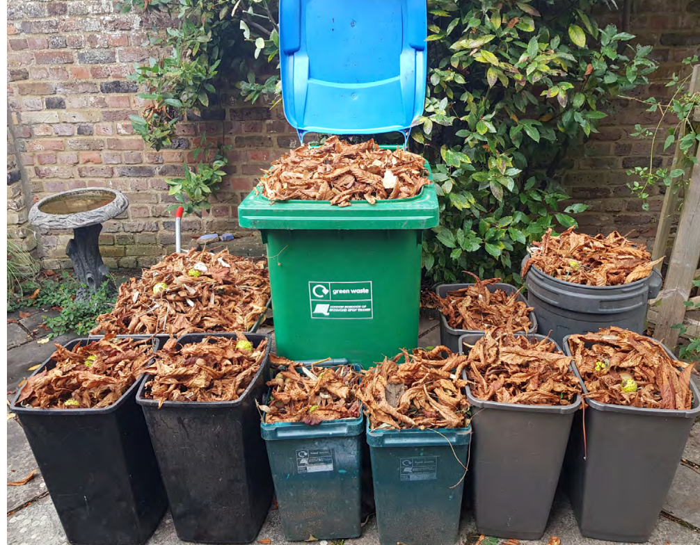
One week's worth of leaves

So, I return to the need for medical attention.